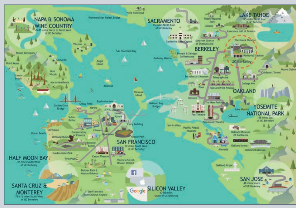
Illustrated by Krystal Lauk, with permission for use from Berkeley Law

UC Berkeley is located in the city of Berkeley, California, a mid-sized city known for its progressive policies and viewpoints, and is a hub of creativity and counterculture. It is just 20 minutes from iconic San Francisco. UC Berkeley is in close proximity to many famous sites, such as the Pacific Coast, the Golden Gate Bridge, Silicon Valley, Yosemite National Park, and the Sonoma and Napa Wine Country.